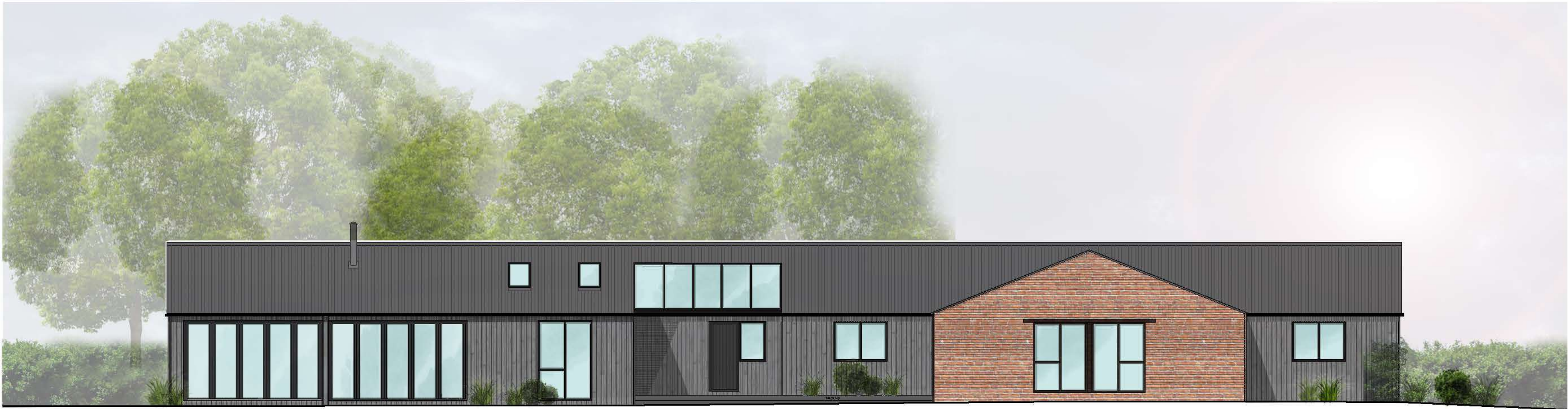
Proposed South West Elevation Scale 1:100