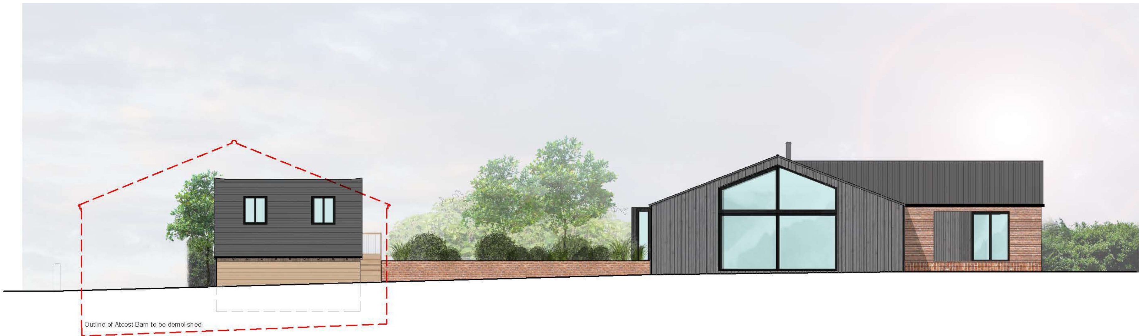
Proposed North West Elevation Scale 1:100

Material Key Walls - Timber Cladding (Black) and Brick Roof - Profile Metal Doors & Windows - Powder Coated Metal